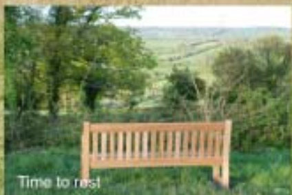
Time to rest