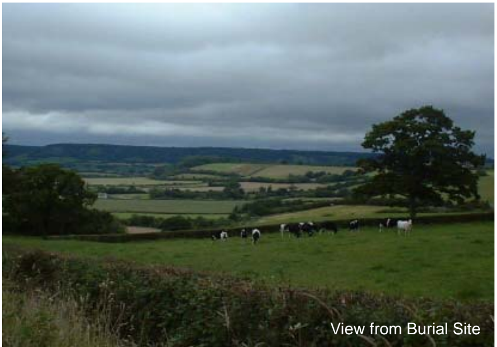
View from Burial Site