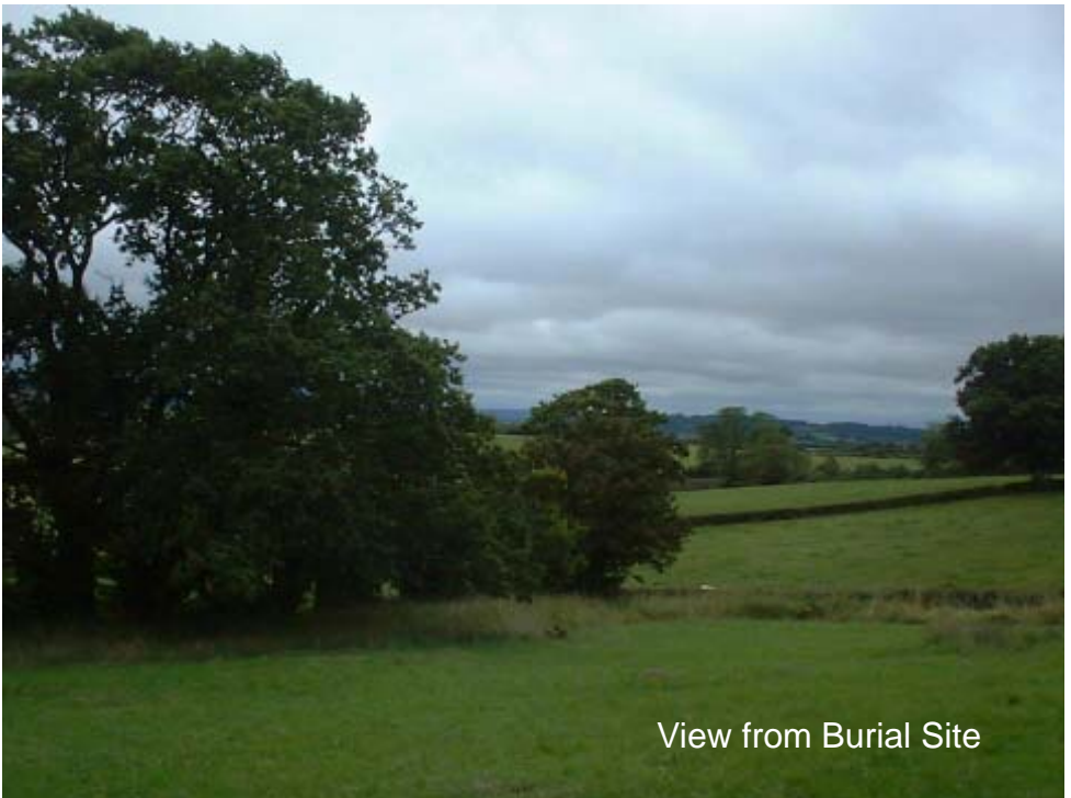
View from Burial Site

The trustees are aware that this is an emotive subject. PLEASE do not put us in the position of having to cause offence by removing inappropriate plants from graves.