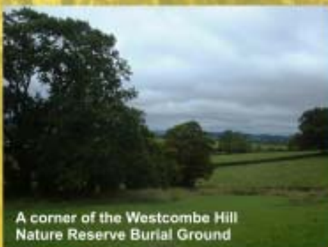
A corner of the Westcombe Hill Nature Reserve Burial Ground

The Butler Memorial Trust is a registered charity administered by volunteers and committed to the provision and maintenance