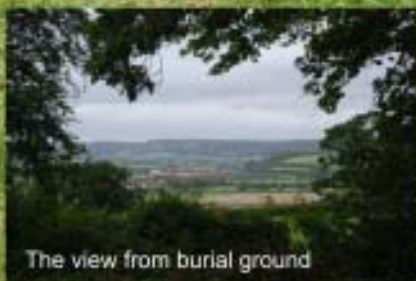
The view from burial ground